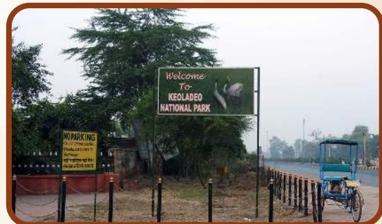
Keoladeo National Park, Bharatpur

Eternal symbol of love, crafted in white marble, breathtakingly beautiful.