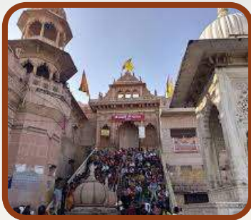
Radha Rani Temple, Barsana

A marble marvel glowing with devotion, Prem Mandir enchants with its intricate carvings and evening lights.