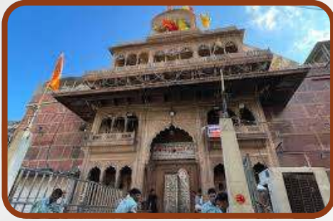
Banke Bihari Temple

Filled with divine energy and soulful chants, this temple captivates with Lord Krishna's playful presence and timeless charm